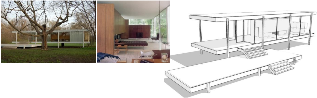
Figs. 5~7: Farnsworth house, USA, designer: Ludwig Mies van der Rohe (1945-1950)