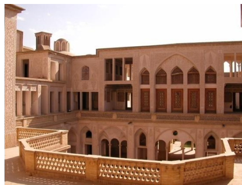
Fig. 5: view of inside yard ABASEEAN home (KASHAN-IRAN)