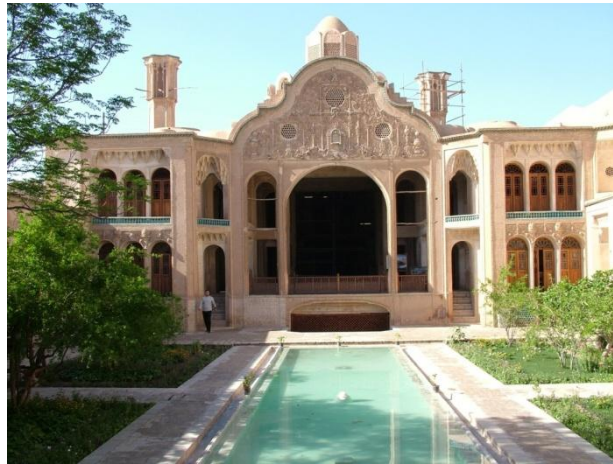
Fig. 3: view of inside yard BROOJERDI home (KASHAN-IRAN)

Another example of modesty in Islamic architecture is internal latency of houses, so Namahram cannot see families. Islamic architecture does not put all house spaces in the eyes of Namahram, and personal home spaces like kitchen, WCs, bedrooms (ladies use them more than the others), so that no one can see there easily. But, such considerations are meaningless in westernized and bare architecture.